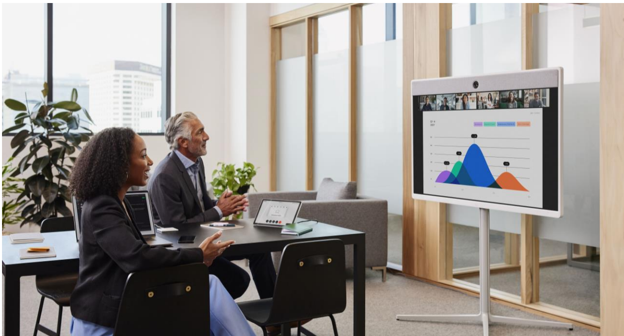
Above: Webex Room Navigator unit used as table-stand room controller

The table-stand Webex Room Navigator touch panel is a purpose-built touch controller designed to bring ease and convenience into modern workspaces by providing instant access to conference controls, smart room booking, room controls and your go-to workplace applications.