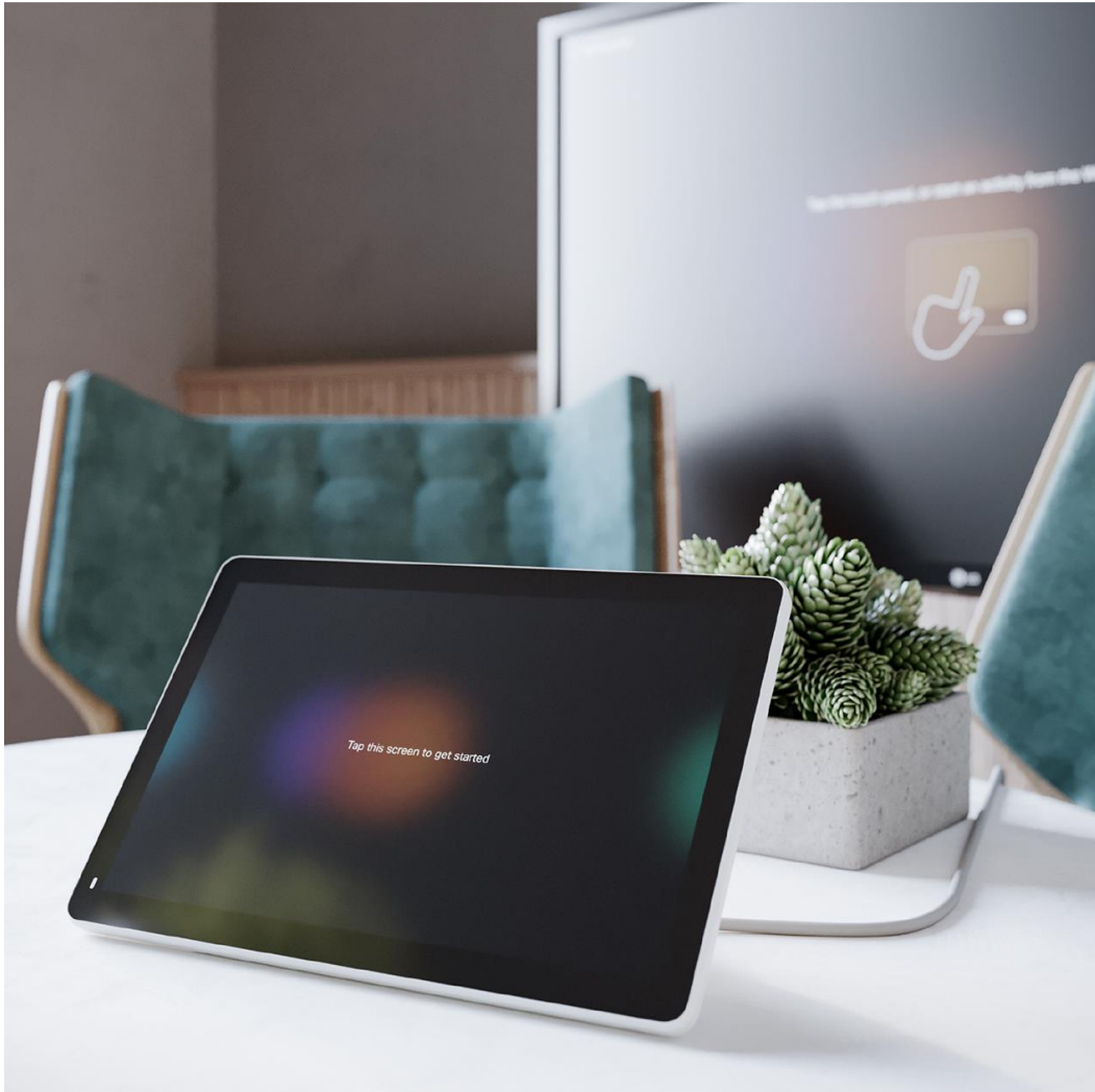
Above: Webex Room Navigator unit used as a standing monitor controller