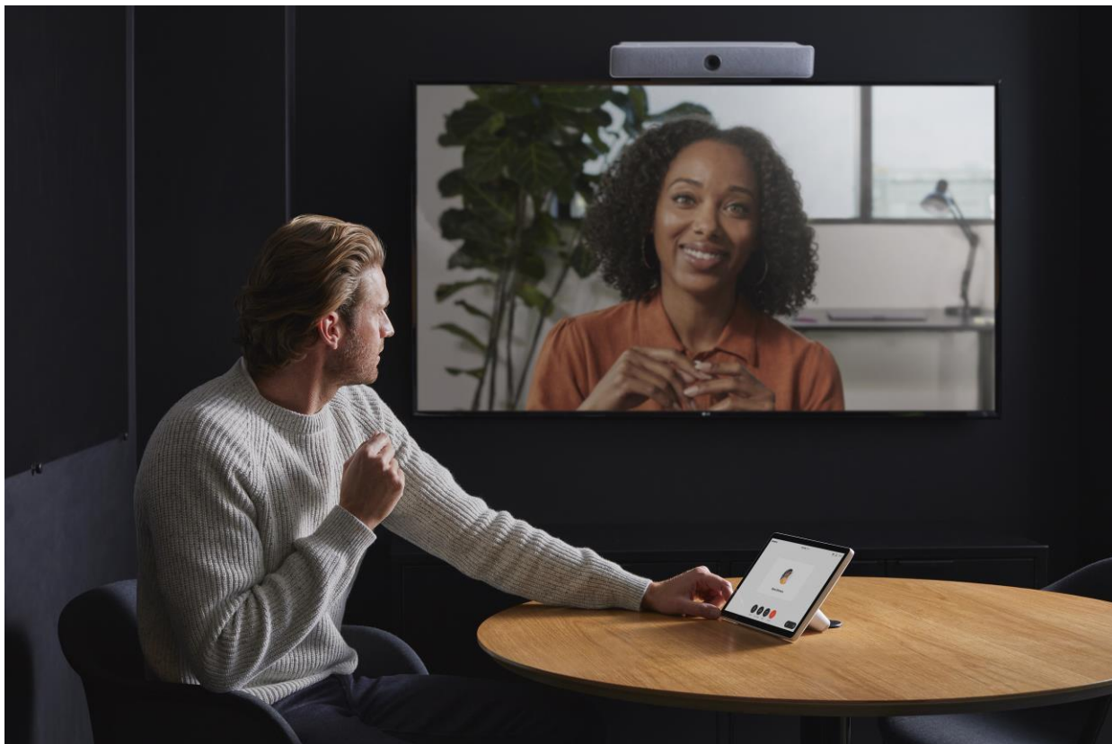
Above: Webex Room Navigator table-stand panel used as a room control device in a small huddle space

Webex Room Navigator for table is a versatile device that combines controls, an intuitive display and sensors into an elegant touch panel. It can be either configured as a room control device or a room booking unit within meeting rooms.