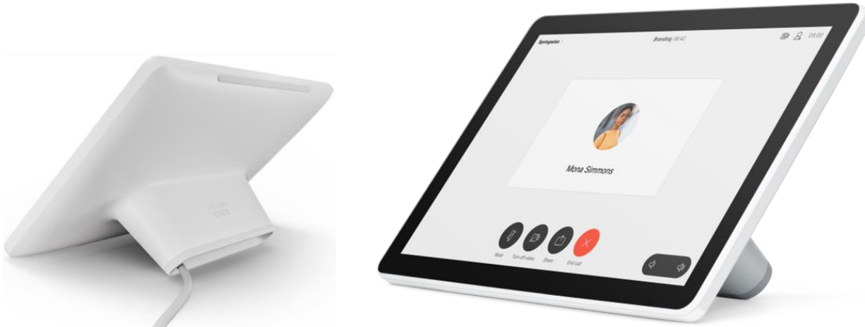
Above: Room Navigator table-stand touch panel from a back and front perspective view