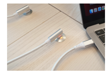
Table integration: Sockets

Ochno provides optimized, 2 meter long USB-C cables to be used as pull-out cables. Available in black or white color. Integrated screw-lock ensures that they don't fall out.